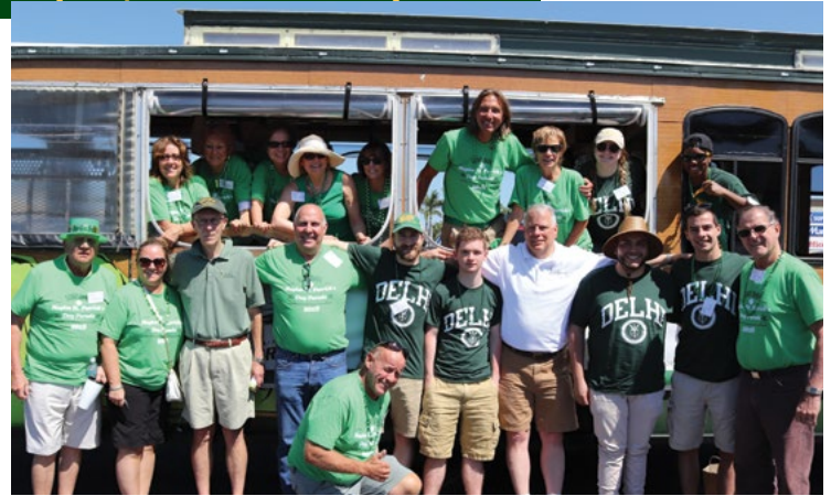
Alumni, students and staff "eyes were smiling" after completing the Naples St. Patrick's Day parade.