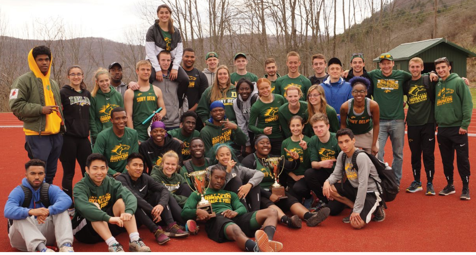
The men's and women's track and field teams have dominated USCAA four-year competition, winning two consecutive USCAA National Invitational titles.