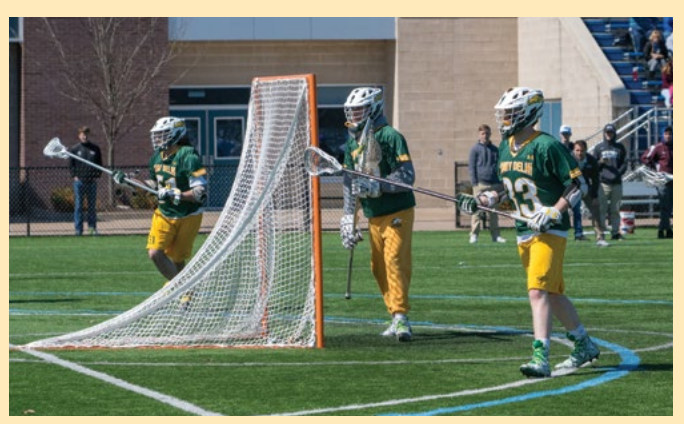
SUNY Delhi's lacrosse and soccer athletes are among those who will benefit from the installation of a synthetic turf field next year.