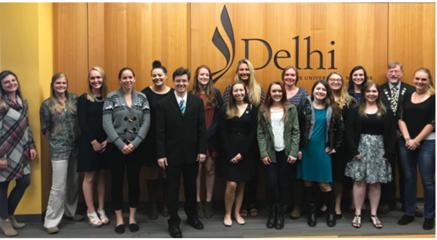
SUNY Delhi inducted 15 members into the Beta Chapter of the Tau Phi Zeta National Honor Society for the first time this fall.

SUNY Delhi has been ranked fourth among the country's "Top 50 Best Veterinary Technician Programs" by TheBestColleges.org.