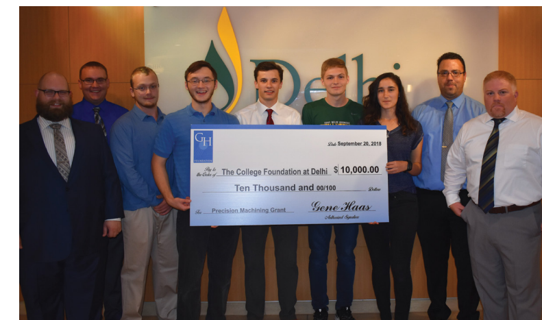
Mechatronics students and faculty beam as they accept a gift from the Gene Haas Foundation.

These accolades add to recognition SUNY Delhi earned in the 2019 Best Colleges rankings by the U.S. News & World Report , released in September. U.S. News ranked SUNY Delhi #18 in Regional Colleges, #11 in Best Colleges for Veterans, #22 in Best Value Schools, and #8 in Top Public Schools in the North region.