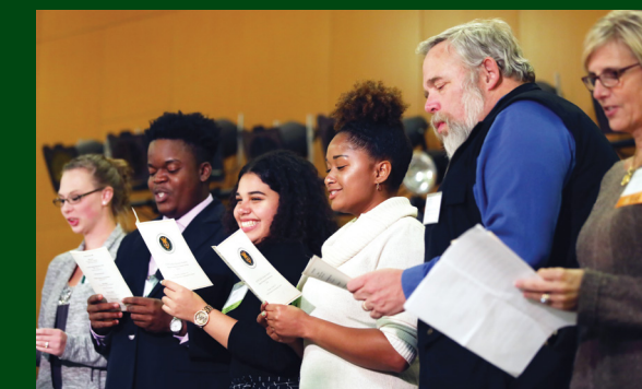
Alumni, students and staff join together in a rousing rendition of SUNY Delhi's alma mater.