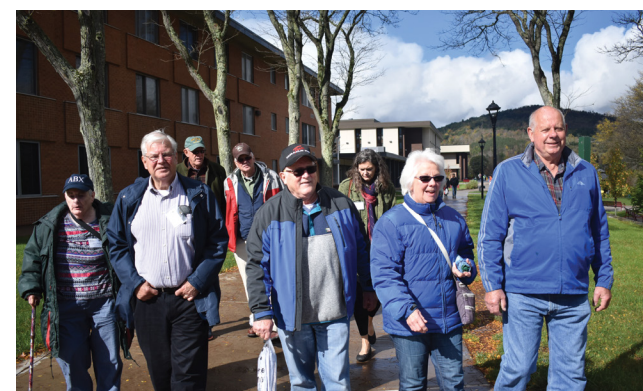
Reunion attendees enjoyed walking tours of campus.