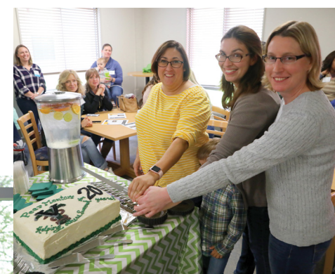
Vet Tech Peer Mentor alumni celebrated the program's 20 th anniversary.