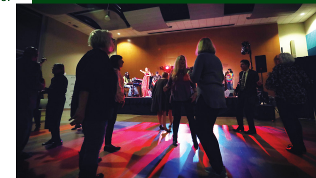
Alumni and guests of all ages danced into the night to the music of Ghostly Legends and Friends .