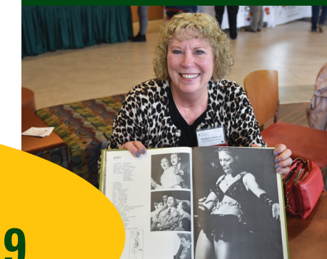
Alumni reminisced about their days on campus while flipping through the pages of Fidelitas , SUNY Delhi's yearbook.

SAVE THE DATE Alumni Weekend & Homecoming 2019 October 25-27, 2019