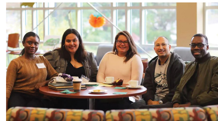
Many alumni reconnected with old friends at the alumni welcome headquarters in Sanford Hall's Centennial Lounge.