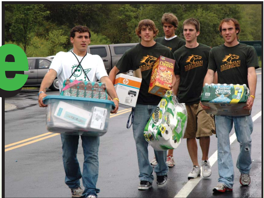
Members of the Cross Country team helped move in students on Orientation Day. For more photos, see page 9.