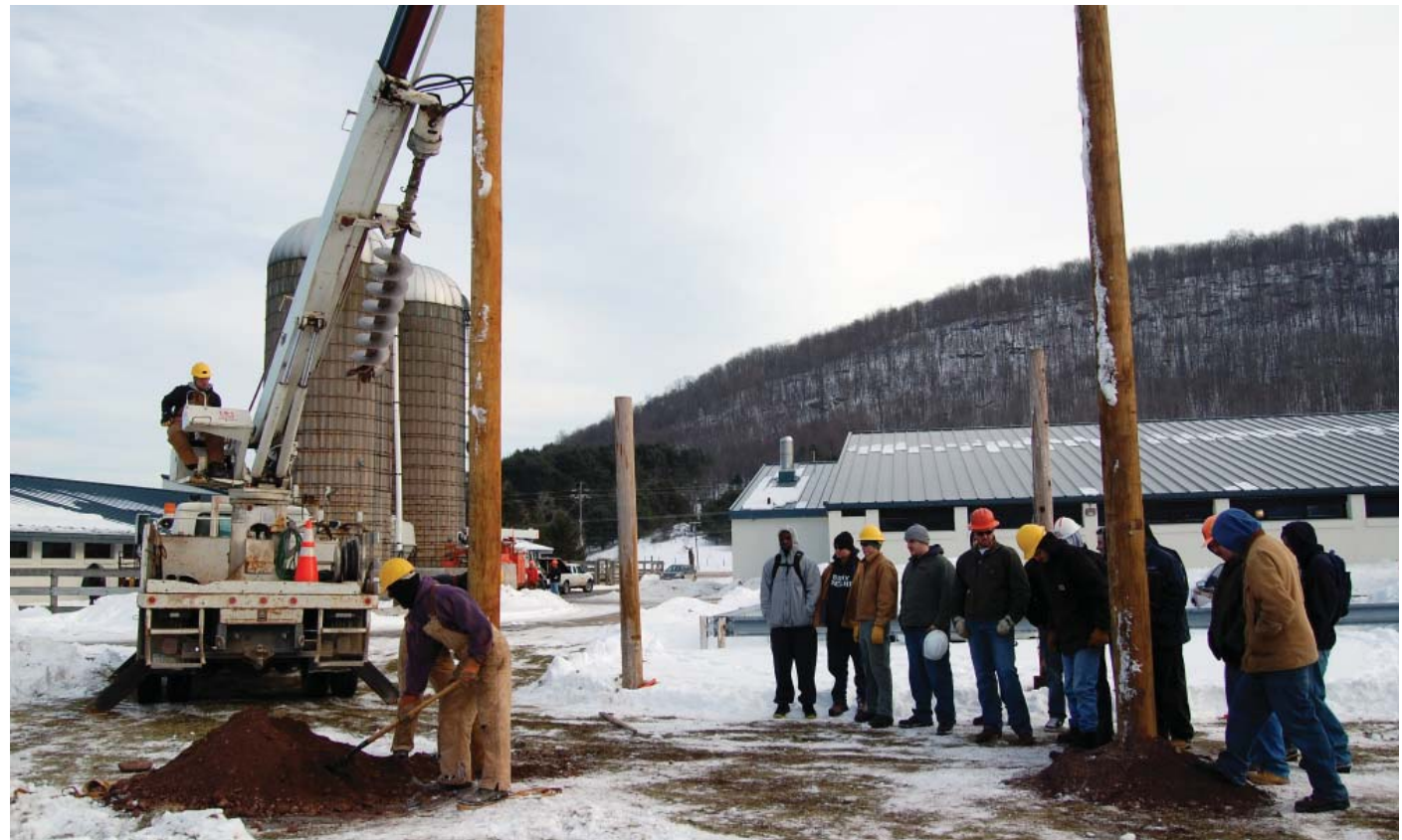
DCEC and NYSEG recently teamed up to install four utility poles on the Valley Campus to be used as a learning laboratory for students in the Electrical Construction and Instrumentation program.

“Our collaboration with SUNY Delhi will help us identify new talent for DCEC through the college’s electrical and construction