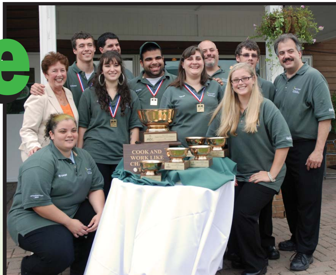
SUNY Delhi's hot food team was crowned the best in the US after capturing the American Culinary Federation Student National Championship in Anaheim, CA, August 3. Read the full story on page 2.