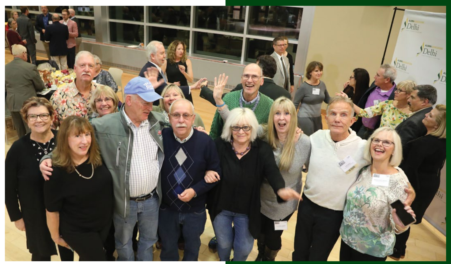
Alumni from across the county reconnected following the Harvest Dinner.