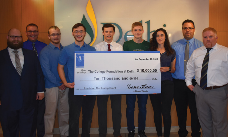
Mechatronics students and faculty beam as they accept a gift from the Gene Haas Foundation.

These accolades add to recognition SUNY Delhi earned in the 2019 Best Colleges rankings by the U.S. News & World Report, released in September. U.S. News ranked SUNY Delhi #18 in Regional Colleges, #11 in Best Colleges for Veterans, #22 in Best Value Schools, and #8 in Top Public Schools in the North region.