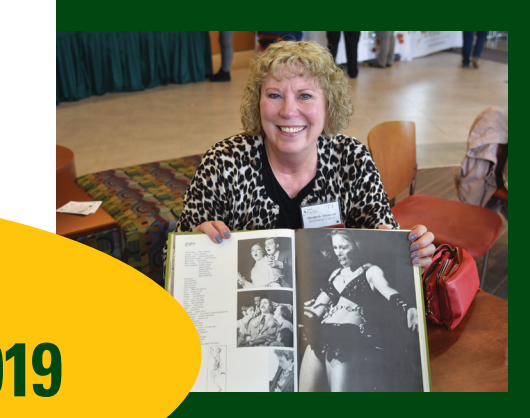
Alumni reminisced about their days on campus while flipping through the pages of Fidelitas , SUNY Delhi's yearbook.