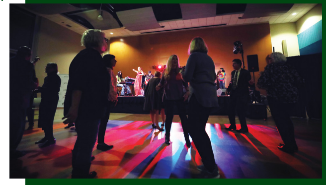
Alumni and guests of all ages danced into the night to the music of Ghostly Legends and Friends .